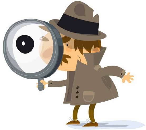
Abb. © Fabrice MOSCA - Fotolia.com

Thus, the company not only decided to use the detection tool but also the optional Business Transaction Agent of Circle Unlimited. For example, this may identify that the user has been listed as a ‘Professional User’ although it would be sufficient, according to the used transaction, to list this user as ‘Limited Professional User’. “These facts contribute to